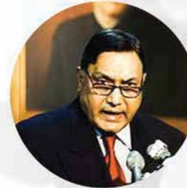
GENERAL MOEEN UDDIN HAIDER

Alumnus of 1957-60. General Moeen uddin Haider was commissioned in Pakistan Army in 1962 in the 26th PMA Long Course. He served as Governor of Sindh from March 1997 to June 1999 and Federal Interior Minister from 1999 to 2002.